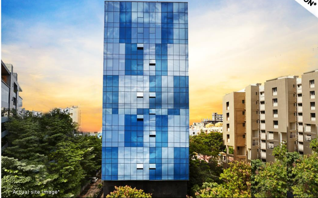
Actual site image