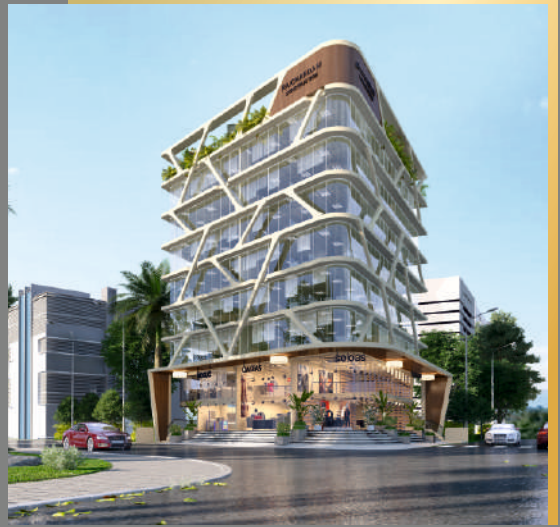
ALPHA-C PAN CARD ROAD