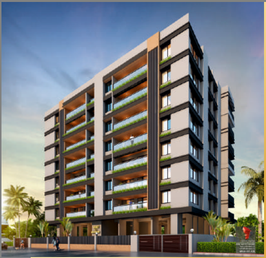
THE SHWET BANER