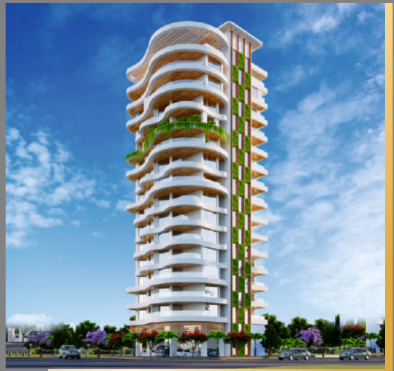
SUNMAN MODEL COLONY